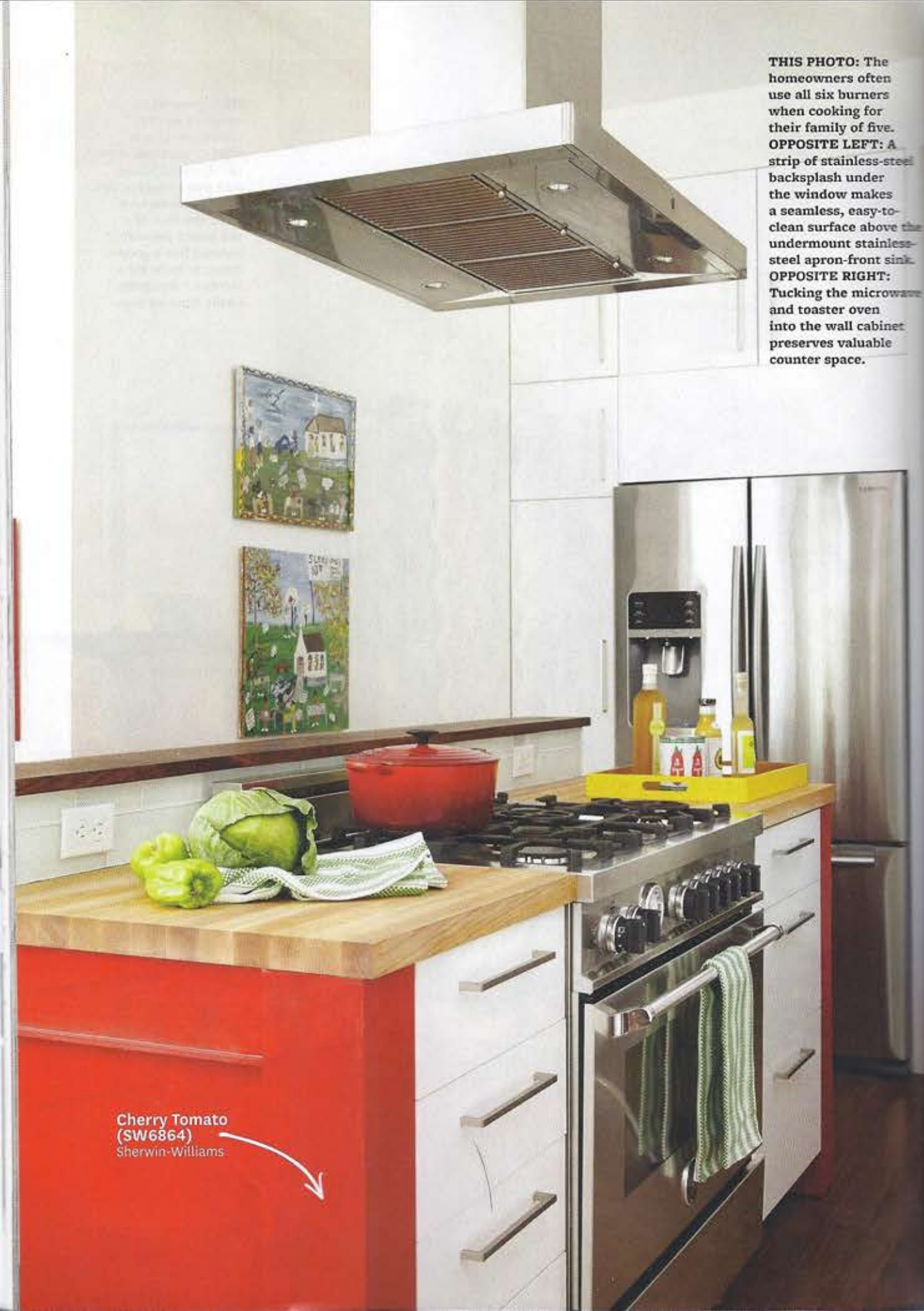
THIS PHOTO: The homeowners often use all six burners when cooking for their family of five. OPPOSITE LEFT: A strip of stainless-steel backsplash under the window makes a seamless, easy-to-clean surface above the undermount stainless-steel apron-front sink. OPPOSITE RIGHT: Tucking the microwave and toaster oven into the wall cabinet preserves valuable counter space.